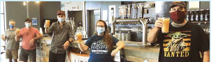
The "Incredible Beer Makers" team from IBM at their partner brewery, Compass Rose.

beers in their own taprooms, then generously donated a percentage of sales back to their teams. Together with our sponsors, brewery partners and corporate teams, an incredible $91,000 was raised for CFOH! In 2021, we anticipate returning to North Hills Midtown Park for Hops for Hope's 7th Anniversary on September 18, and we hope to see you there. Visit www.trianglehops4hope.org to find out how to participate!